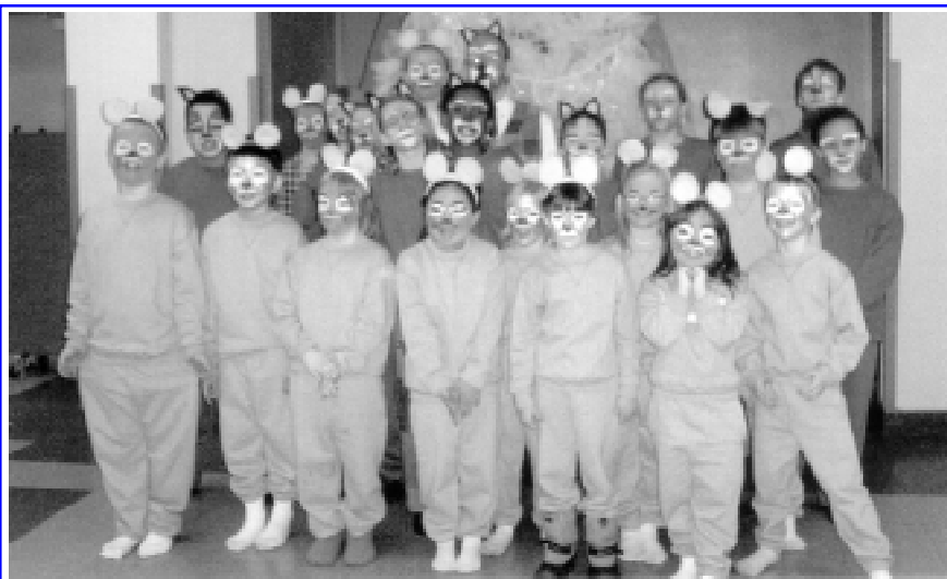
The Cast Assembles for a Picture.