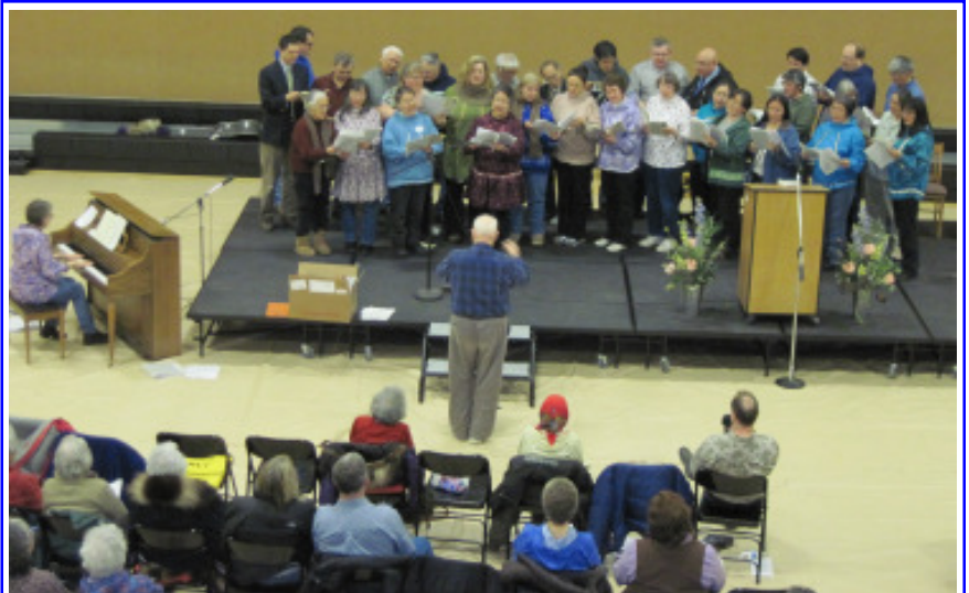
The Covenant High Alumni Choir performs.