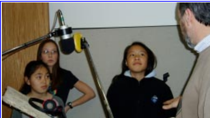
Koyuk Girl Scouts prepare to be interviewed in the Genesis Recording Studio.

by mountains and teeming with all kinds of wildlife, plants and flowers. I actually saw a Roadrunner and I thought they were just in cartoons. We were invited to bring our Norton Sound Silver Salmon...enough to feed 200...and tell of the "state of the station" to our supporters. The dinner was held in an outdoor garden at the Z Mansion in downtown Tucson. It's been a long time since I wanted to eat outdoors! There was even live harp music. It was a totally delightful evening. We have another Salmon Dinner planned for August 4th in Arvada, Colorado and another on October 8th in Stephenson, Michigan. Maybe I'll see you there! ■