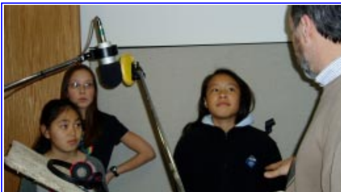
Koyuk Girl Scouts prepare to be interviewed in the Genesis Recording Studio.

by mountains and teeming with all kinds of wildlife, plants and flowers. I actually saw a Roadrunner and I thought they were just in cartoons. We were invited to bring our Norton Sound Silver Salmon...enough to feed 200...and tell of the "state of the station" to our supporters. The dinner was held in an outdoor garden at the Z Mansion in downtown Tucson. It's been a long time since I wanted to eat outdoors! There was even live harp music. It was a totally delightful evening. We have another Salmon Dinner planned for August 4th in Arvada, Colorado and another on October 8th in Stephenson, Michigan. Maybe I'll see you there! ■