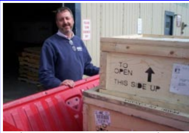
The new 1,000 watt FM transmitter and exciter loaded in the pickup.