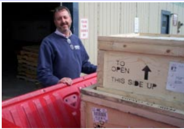
The new 1,000 watt FM transmitter and exciter loaded in the pickup.