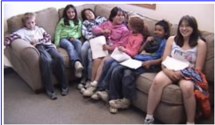
Nome children waiting for class to start in the KICY staff lounge.