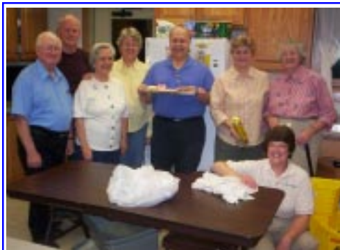
The Stephenson, Michigan team gathers for a post salmon dinner photo opportunity last October.

I really enjoy any opportunity to tell the story of KICY through a PowerPoint presentation. It's like sharing the family photo album. ■