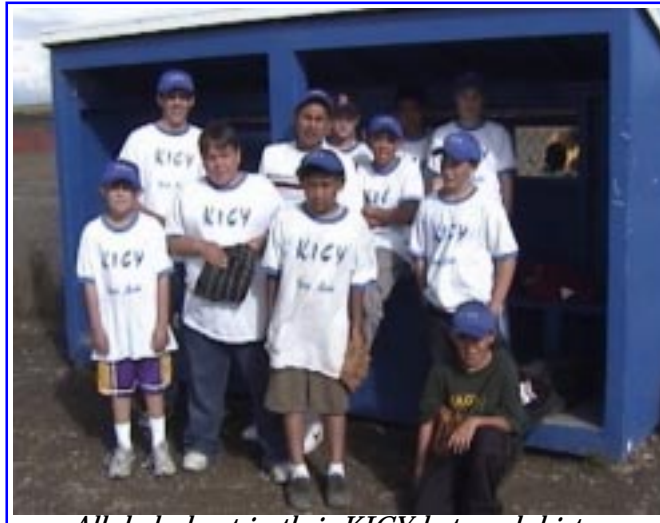
All decked out in their KICY hats and shirts.

The local softball teams are operated under the direction of the Nome Recreation Center. There are enough children of a variety of ages