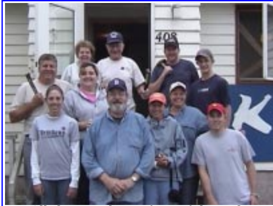
All eleven gather in front of the studio.