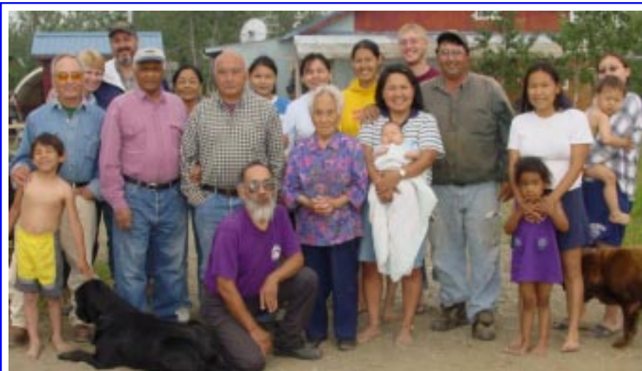
The Fish Camp group gathers for a photo opportunity.

Thanks to you who have made our time here so productive through your prayer, sacrifice, labor, financial gifts and emotional support. You make it all possible. ■