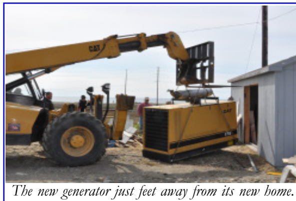
The new generator just feet away from its new home.