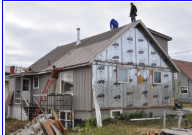
The KICY Brown House under renovation.

On another very exciting note, the FCC granted (in just one week from the day we applied for it) a special experimental license to install new, energy saving technology in our 50,000 watt AM transmitter. This system has been used by the BBC and other European and Oriental broadcasters for some time. KICY is the first commercial station in the U.S. to receive the approval to install and test the Harris ACC+ system. It is estimated that KICY could save up to 35% on power costs to operate the AM transmitter. With no relief in sight for our energy costs, this technology could make a huge difference in our ability to share the Good News to the uttermost parts of the earth. Pray for successful testing. ■