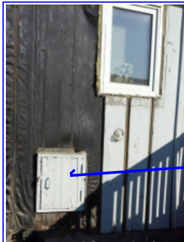
One of the last honey bucket doors in Nome gets sealed.

The door on the new Generator Building was also re-fitted with gaskets to keep the snow out. ■