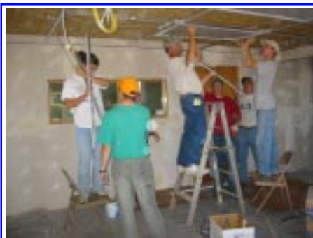
Very, very busy.

Just a few weeks ago, we had exposed 2 X 4's, new wiring and lots of prayers. We weren't sure our lobby would be finished this year and that meant living out of boxes through the winter.