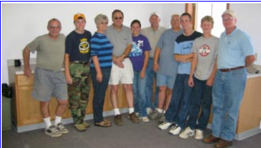
Taking time out to admire a job well done.