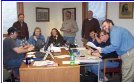
The operator team in full contest mode.