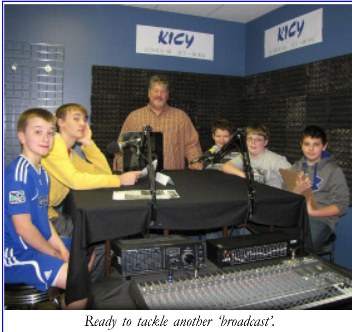
Ready to tackle another 'broadcast'.