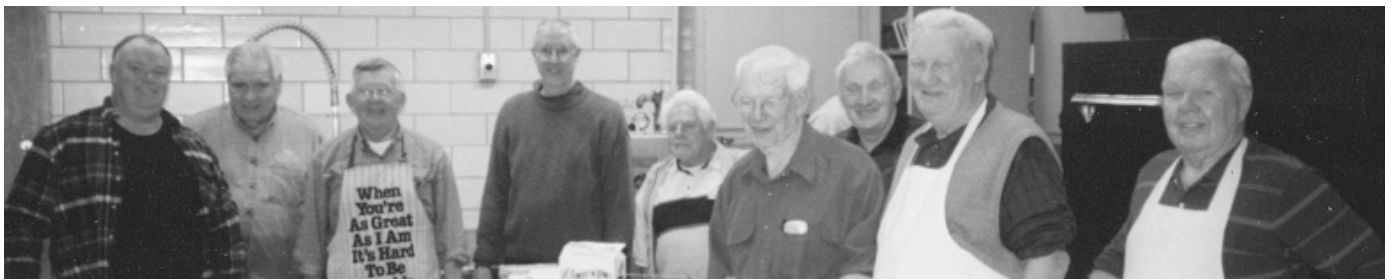
The Trinity Men gather in the church kitchen for a photo opportunity.