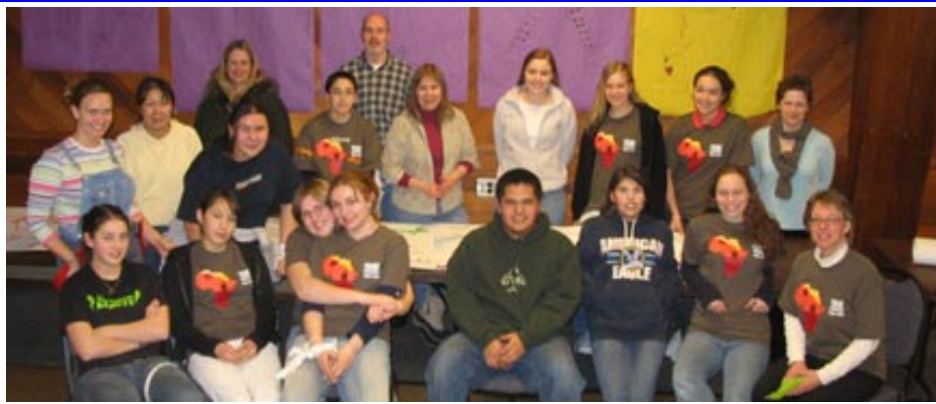
The youth gather for a mid-famine photograph.