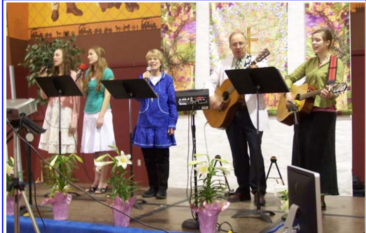
The Nome Covenant Church's Praise Team.

Spring is in the air, even though the average daytime temperature is only in the mid teens. The extra sunlight and longer days (it's light until 10 pm) let us know that breakup isn't too far away. ■