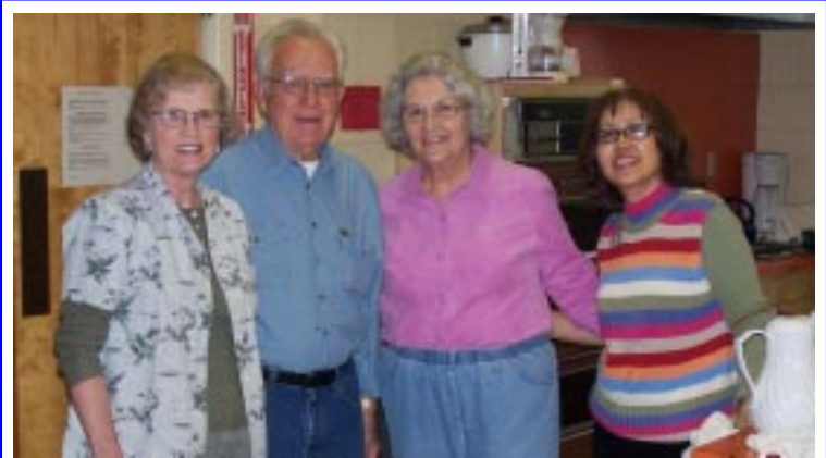
Thanks to the hardworking kitchen staff at Community Covenant in San Andreas.