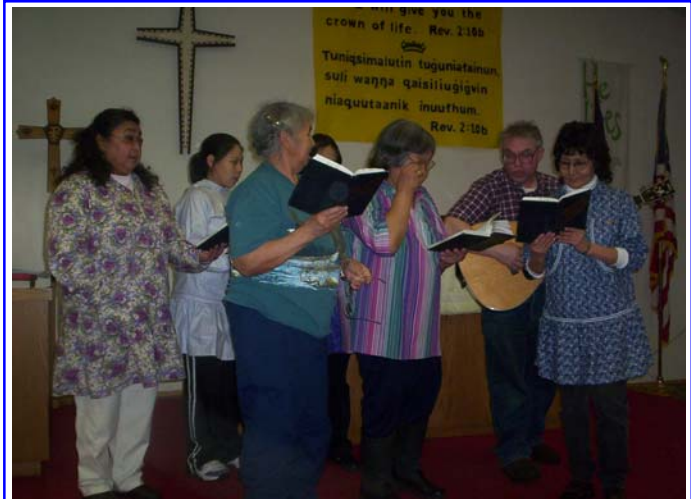
A village group prepares to perform.

Again, please pray for our very busy summer work schedule. ■