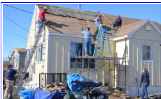
Replacing the roof on the Yellow House.

Summer is a big time to get things done in the arctic. We have about a 60 day window to fix the things we