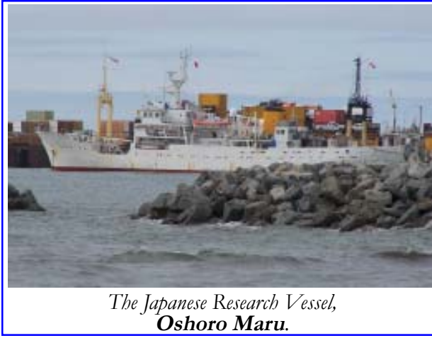
The Japanese Research Vessel, Oshoro Maru.