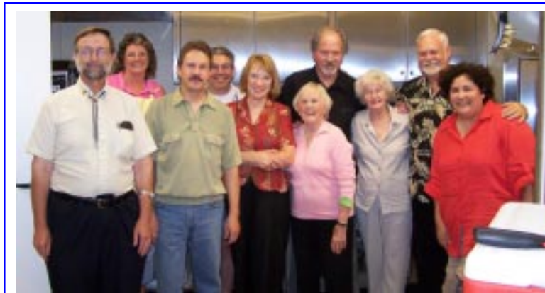
The Missions Team at Hillside Covenant gather in the new church kitchen.

Plans are already forming for the spring tour. Is your church planning a KICY fund-raising event?