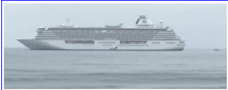
The Crystal Serenity lays at anchore while passengers are brought to shore by tender.

The Crystal Serenity arrived on a rainy August Sunday morning. This was the first ship of its size, 820 feet and over 1,000 passengers, to drop anchor in Nome waters. From here, the destination was the Northwest Passage, now rapidly filling with ice.