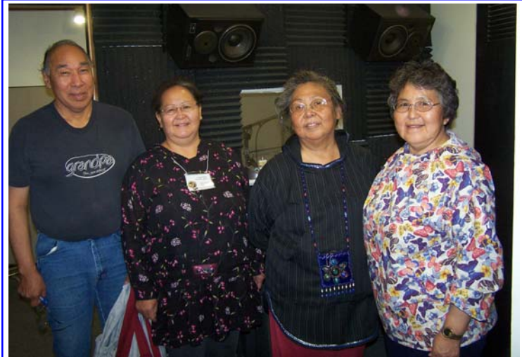
The DaySpringers in Genesis Recording.

Then, it's well into the Thanksgiving and Christmas season with community dinners and musical events. I've been trying to figure out when our busiest times are here at KICY. It's always busy. But, I've never had a job that I've enjoyed more or that was more satisfying. Sharing the Good News 24 hours a day is a great responsibility and a great joy. ■