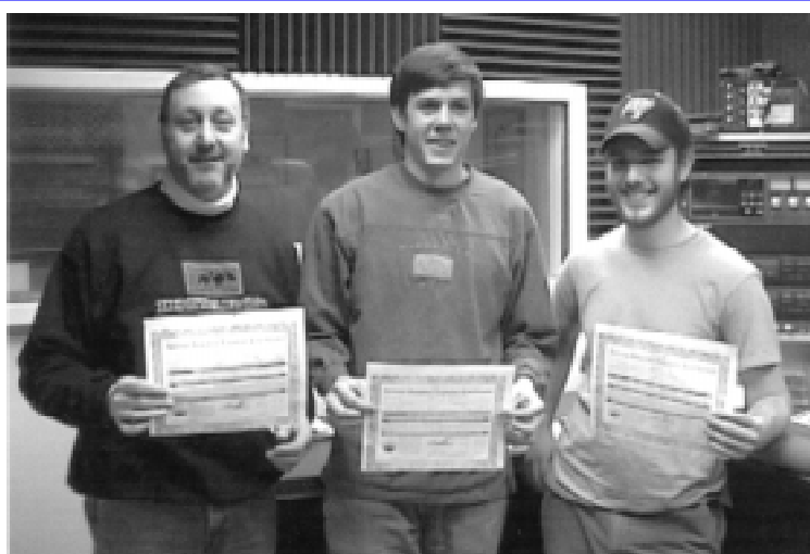
Posing in the Studio with test certificates.