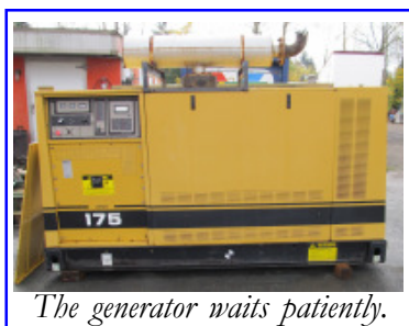
The generator waits patiently.

come to Nome this summer to install the generator and work teams scheduled to make sure the generator has a snug, new home. ■