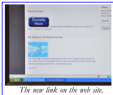
The new link on the web site.

Now, making a donation to KICY is just a mouse click away. Or, you can use the new “Donate