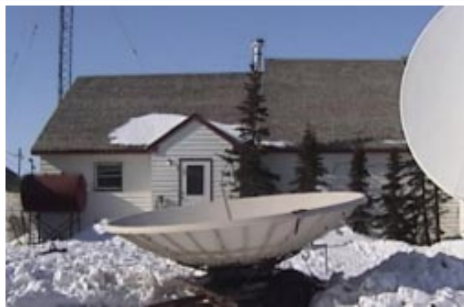
The old satellite dish rests on a trailer in the snow. The tower to be replaced can be seen standing behind the building on the left.

Contemporary Christian music, the nation's fastest growing music category, has a huge following in Nome. With your help we'll bring the Word into homes and offices throughout greater Nome. ■