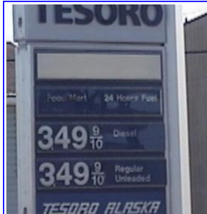
Up from $2.49 an hour before.

I had just finished a CareForce Prayer request program recently and