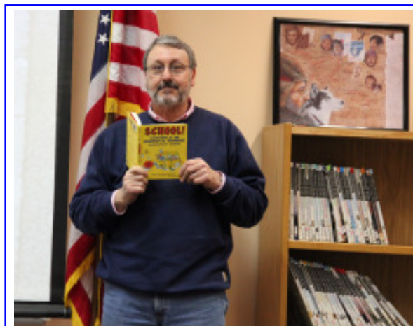
Guys Read...and I can prove it.