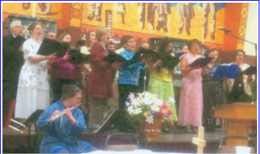
The Community Chorus performs at the Easter service.

KICY is honored and blessed to provide that service. ■