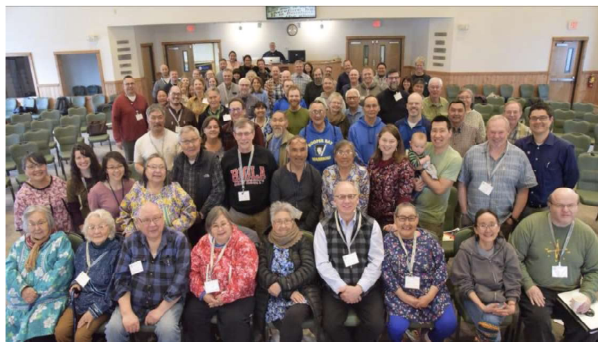
Delegates to the 2018 Alaska Conference Annual Meeting held in Nome