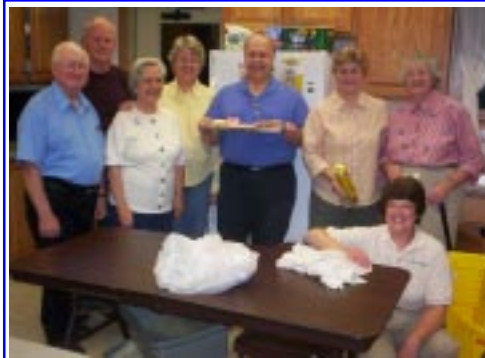
The Stephenson, Michigan team gathers for a post salmon dinner photo opportunity last October.

AM-850 & ICY 100.3 FM P.O. Box 820 Nome, Alaska 99762