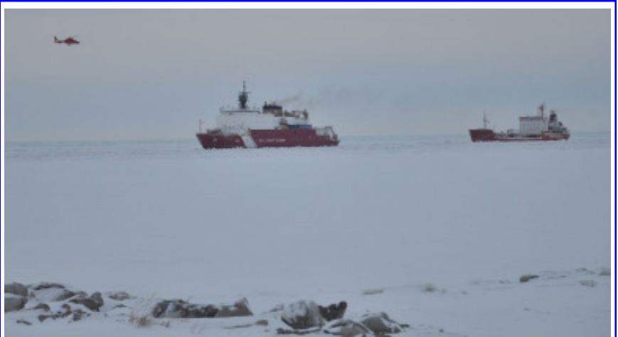
The USCG Cutter Healy, the T/V Renda and a helicopter at the Harbor.