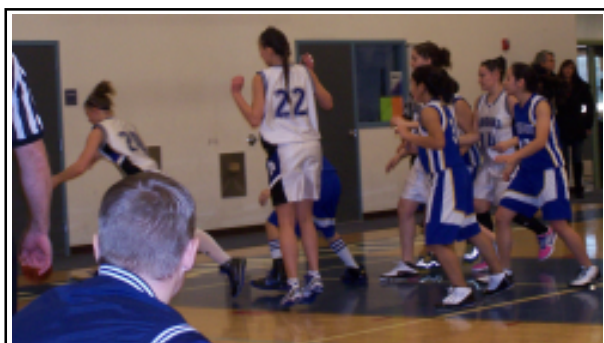
The Lady Nanooks on the road to fourth place.

A big congratulations to the Nome Nanooks boys and girls basketball teams. Both made it into a playoff berth at the state tournament held in Anchorage this season and broadcast live on KICY AM-850.