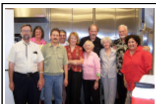
A recent Salmon Dinner team.

If your church would be willing to partner with us, we'd welcome the invitation. ■