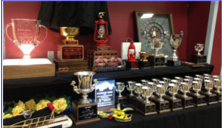
The table is full of awards for the Musher's Banquet.

On another note, I had the privilege of obtaining my Amateur Radio Volunteer Examiner credentials. Three of us from Nome traveled to Unalakleet to administer the Technician license test. Five passed. Each was awarded a dual band radio. Our club also set up a repeater so they could get on the air before we left the village. There have been many more requests for testing in Unalakleet as well as Shaktoolik, Teller and Elim. It's a real joy to 'light up' an Alaskan Village with ham radio. Our next project is to donate an IRLP (internet connection) in each village. ■