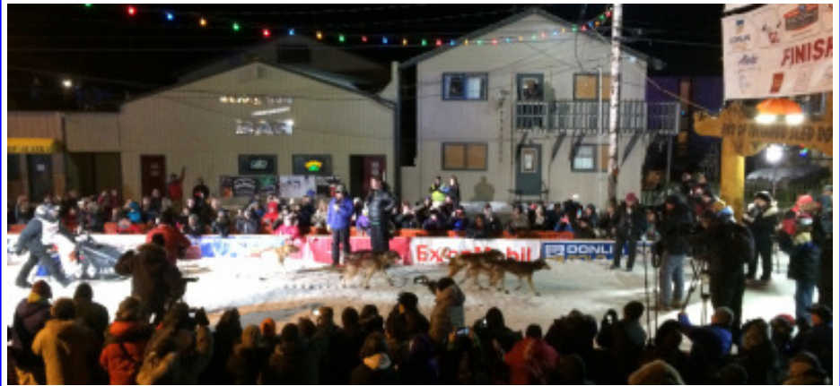
Dallas Seavey crossing under the Iditarod arch.

This year, there are no conflicting dates between the Lutheran and Covenant Conferences, so we can easily cover both events. ■