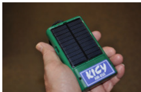
The new, slim, trim solar powered radios.

A few weeks ago, news of the arrival of the radios caught the attention of the local elder care facility called Quayanna Care. They asked for a dozen radios for their patients. We were delighted to be able to supply them.