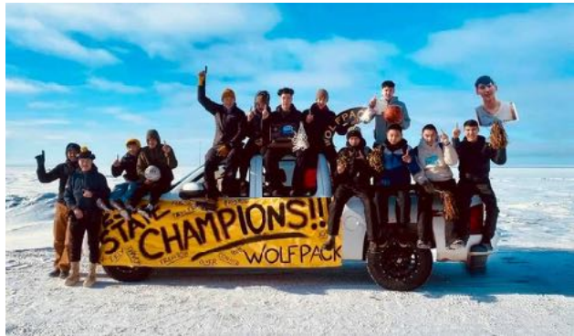
Unalakleet Wolfpack

The Shishmaref boys placed 5th and their girls' team placed 6th. The Shaktoolik girls' placed second, and the championship went to the Shaktoolik Boys, their first state championship.