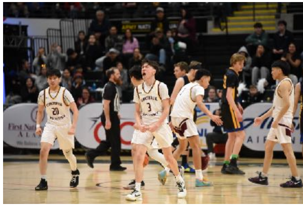
Shaktoolik Wolverines

March Madness in Alaska is all about high school basketball. This year KICY followed four Bering Strait School District teams as they made their mark at the state tournament. Shaktoolik and Shishmaref girls' and boys' teams earned their spots in the 1A tournament and represented their communities well.