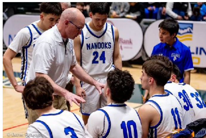
Nome Nanooks