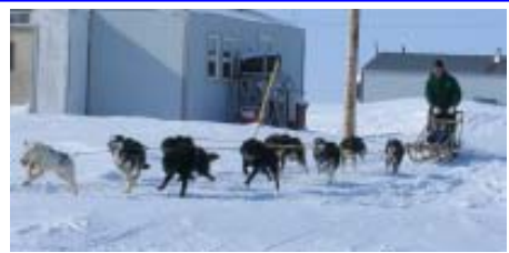
A Brevig Mission team out for a run.