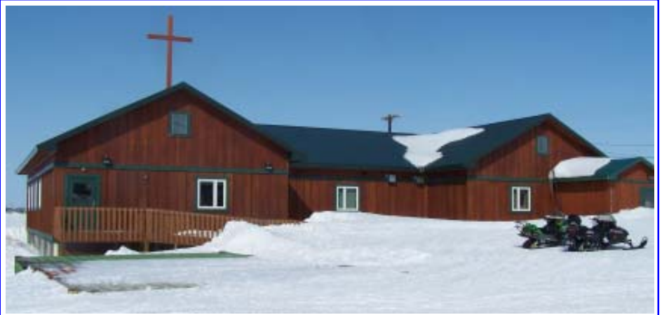
The new Hooper Bay Church building and Youth Center/Coffee Shop.