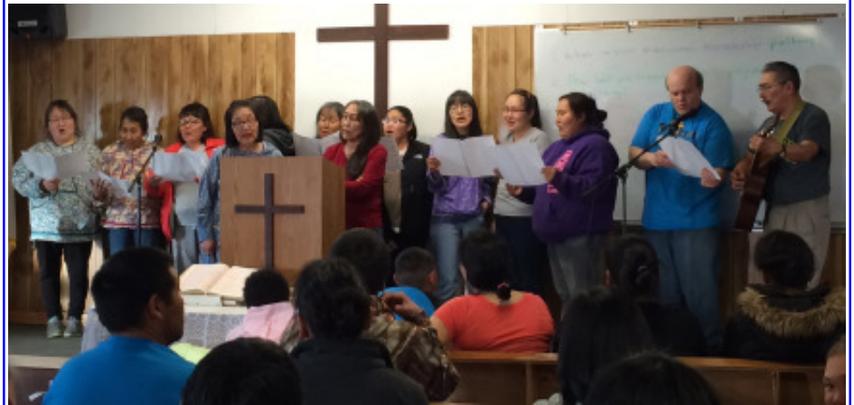
The Scammon Bay Choir Performs.