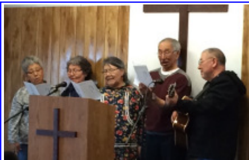
The Shaktoolik Team Sings.

It was truly a joy to spend time with the people of Scammon Bay and those visiting from all over Alaska for the conference. A huge thank you, too, for the gracious and generous hospitality shown throughout the weekend. I had an opportunity to sample foods I had only heard about.