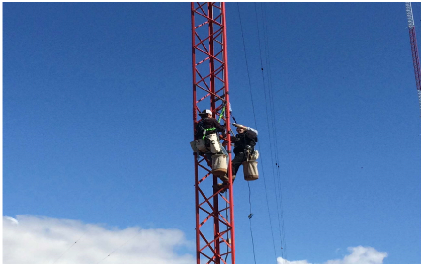
Tower Team replacing braces

A tower team from Nolan Brothers arrived May 27th to begin the arduous task of replacing over 900 braces on two of our towers. The weather was questionable, but with the promise of sunny days ahead the team began the rigging process. The skies cleared and steady progress has been made with two teams of two on each tower and a runner on the ground. The team will spend about three weeks, working long hours each day, bolting each one in place. Weather is always a factor, and we are trusting it will remain calm and rain-free for the duration of the project.