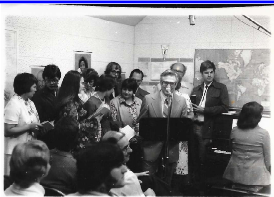
KICY-FM Dedication Service October 1, 1977

...I've been listening to it (FM) and I feel that this is the best thing that's happened to Nome in a long time! I hope it will help the morale of people...as it has mine already.