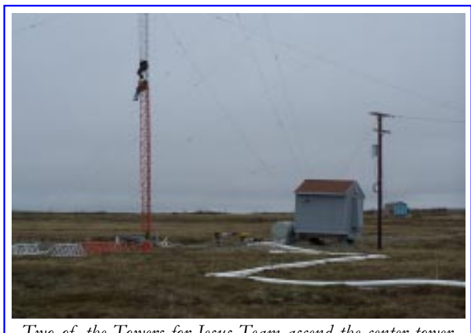
Two of the Towers for Jesus Team ascend the center tower.