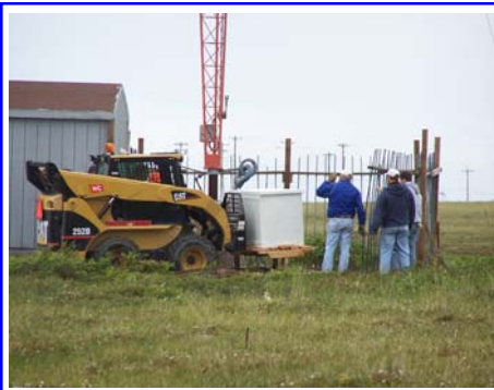
Mounting the West Tower ATU on its new piers.

With 24 hours of sunlight, there were many opportunities for exploration, beachcombing and fishing. One group was able to travel to the village of Teller and another went as far as The Last Train to Nowhere on the Council