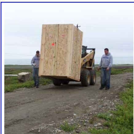
Here comes one of five phasor cabinets.

While the big crates were being transported, another team was painting, building shelving and organizing our new storage building which was the former generator building. Here will be stored all of the extra tower lights, insulators and the tower erecting and maintenance tools. In the process, the team also cleaned out the old generator buildings at both the studio and the transmitter site. We