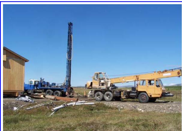
The drilling rig and crane/pile driver.