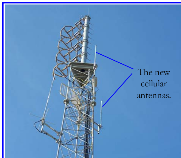
The new cellular antennas.

small cellular antennas and a GPS antenna and we had room to house the equipment.