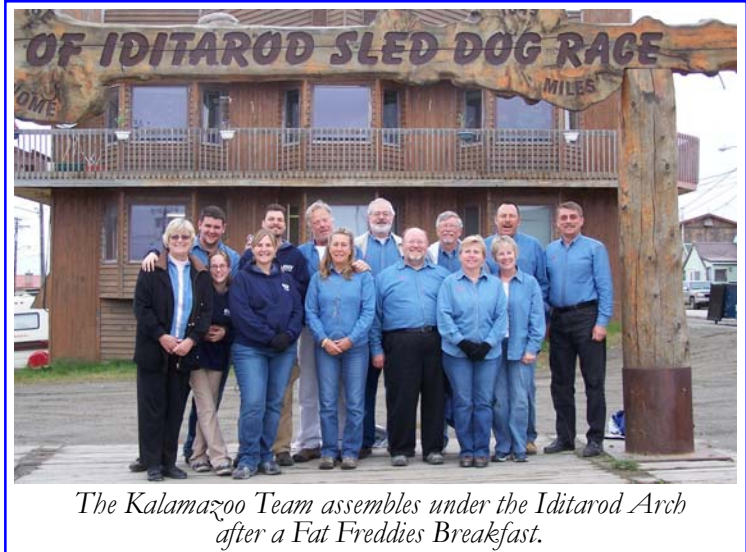
The Kalamazoo Team assembles under the Iditarod Arch after a Fat Freddie's Breakfast.