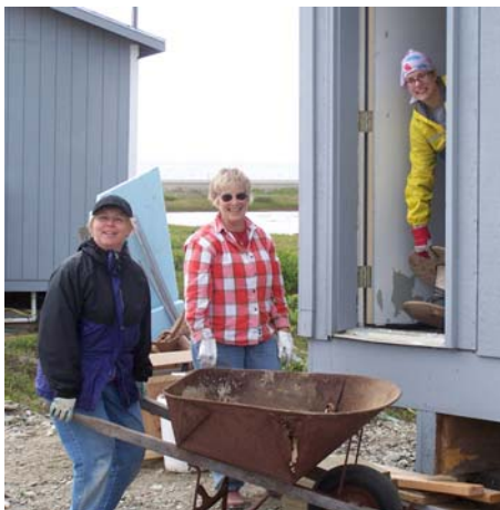
Keeping things organized is extremely important.