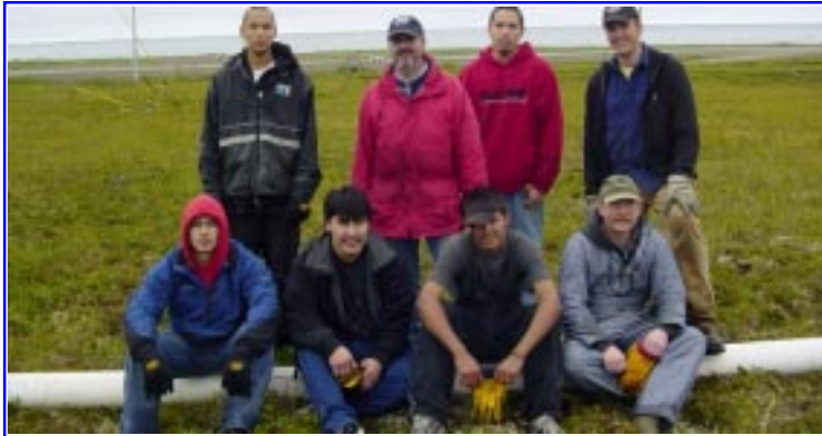
The team assembles at the end of a job well done.