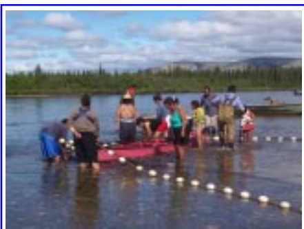
Seining for pinks on the Niukluk.