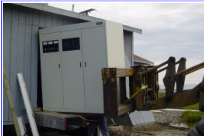
The Heavy End of the AM Transmitter Gets a Ride.