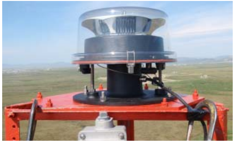
A new tower light viewed from the top of the tower.

It was a time of refreshment and renewal and a time to share the 50 years of miracles of KICY. ■