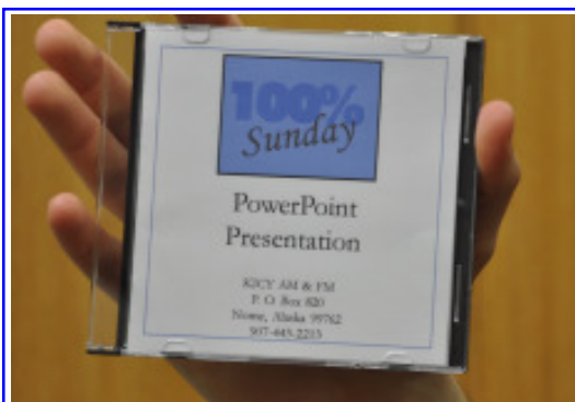
Order your 100% Sunday PowerPoint Presentation today.

Thanks in advance for your 100% participation on 100% Sunday. ■