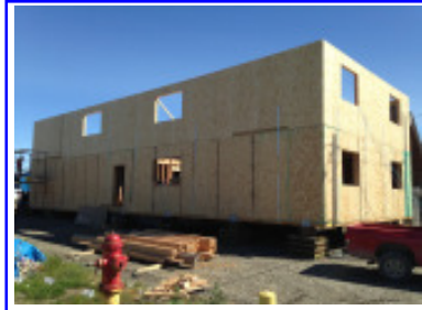
Ready for roof trusses.

The third team from McPherson, Kansas got the entire second floor walled in ready for roof trusses.