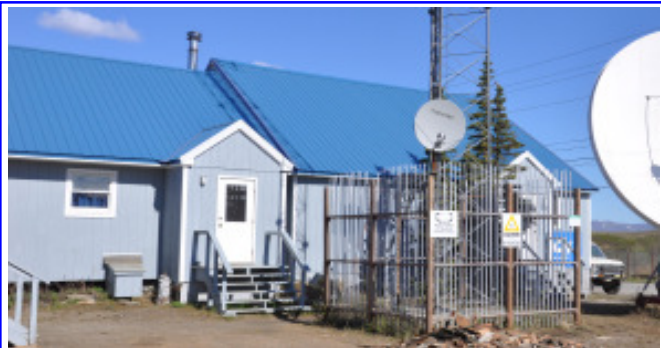
The cedar shakes are off and a new metal roof is installed.

The first volunteer work team arrived in Nome the last weekend of May to get a jump-start on much needed projects. The group from Tucson quickly formed two sub-teams with part of them going to work on the studio roof. The balance of the team got busy residing and replacing windows in the Yellow House. I am delighted to report that this will wrap up most of the major, exterior renovations to KICY properties. From this point on, we will be looking at smaller (up to 6 members) work teams concentrating on