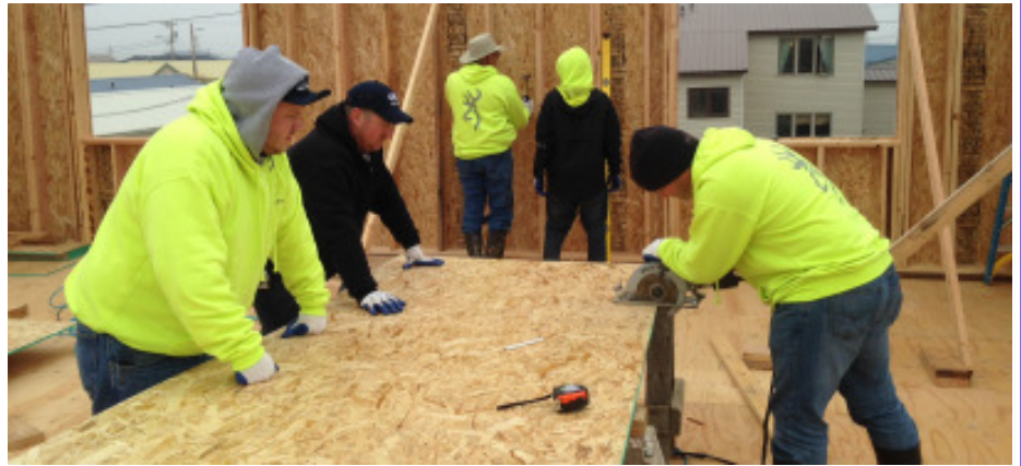
The team from McPherson, Kansas works on the second story of the new Tri-plex.

This marks the end of all the major exterior projects for all the KICY buildings. From this point on, we hope to use smaller work teams of from 4 to 6 members who will work on interior remodeling projects. The three apartments inside the studio building could all use a good updating. ■