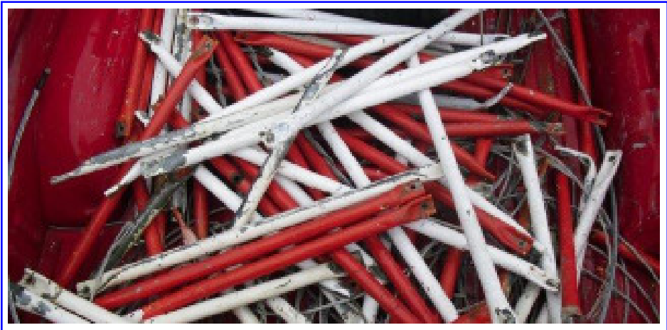
Our pickup loaded with bad braces from 2014. Now, we can make a final fix.

We have already begun to post projects for next summer but of course, the big project, which volunteers can't even help with, will be the rebuilding of the two AM towers. Please keep the safe completion of that project in prayer.