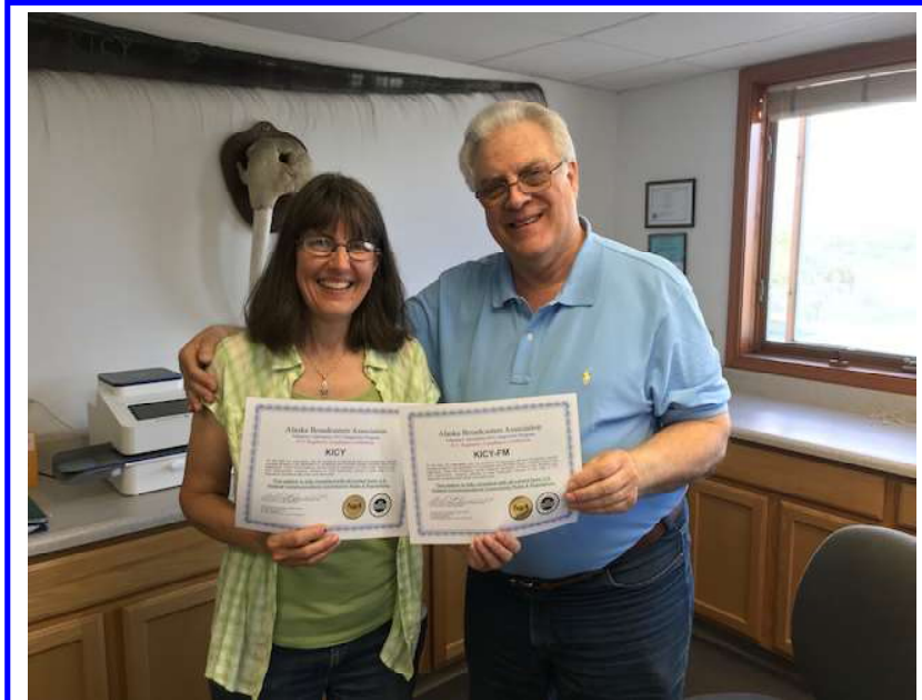
New Inspection Certificates now hang proudly on the station wall