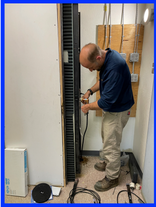
The FM transmitter gets a new home in the KICY studio building