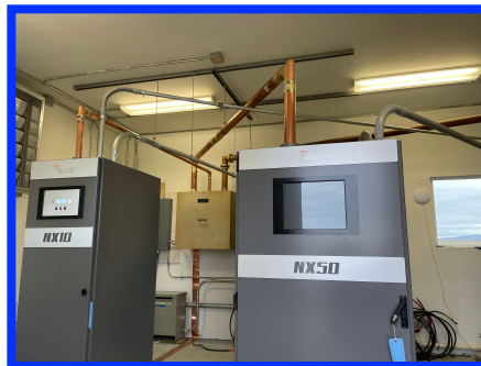
Two new transmitters