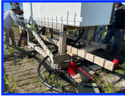
Stabilizing the tuning box at the East Tower