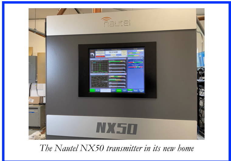
The Nautel NX50 transmitter in its new home

June and July were busy months at KICY. Projects that had been in the works for the past two years finally came to fruition. It all started in early June with the arrival of "The Dream Team," a group of eight amazing engineers and willing workers determined to install the new 50kW transmitter. Unfortunately, one of the major components of that unit was damaged in transport so the final install was put on hold until a new part could be sent. But God provides, and our 10kW back-up transmitter arrived in time for the team to install it before they left, assuring that we would be able to stay on the air until the 50kW could go on line. They did most of the prep work for the 50kW as well, so the final installation would take hours rather than days.