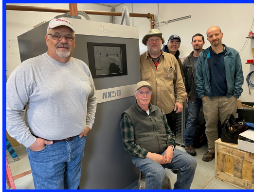
The "Dream Team"