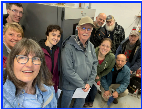
Transmitters dedicated for service to the glory of God (for a copy of the service text visit kicy.org .)