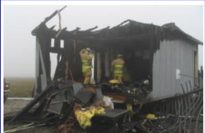
The transmitter was moved from here a month earlier.

On October 23, it's time for 100% Sunday, when we ask every person in a Covenant Church that day to donate a single dollar to our broadcasting mission. Please pray for safe travels and successful fundraising events. ■