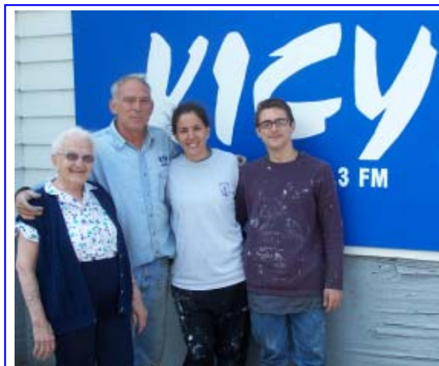
Four generations of Tuggys in front of the studio. April repainted the studio sign.

We thank all who make the Lord's work here in Nome possible. ■