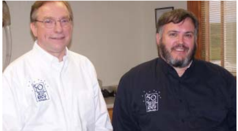
The 50th Anniversary dress shirts available in both white and blue.

Covenant Church has received our mailing with a new bulletin insert included. Every Covenant Pastor has received an e-mail reminding them of the event and asking for their support. New bulletin inserts have been posted on our website. And, every church has been notified that a new, narrated PowerPoint Presentation has been produced and is awaiting distribution. The KICY staff has been hard at work to help make sure that everyone knows and participates in 100% Sunday. If your church missed the suggested date of October 25th, it's not too late. Pick a date that works best for you. If we are to continue to serve our listeners, we need your help. ■