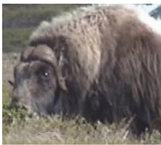
A resident Musk oxen.

sightings on the east end of town, these guys probably walked down the road at our transmitter site to get into town. Fortunately, no harm was done,