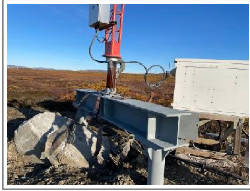
Before: The original base