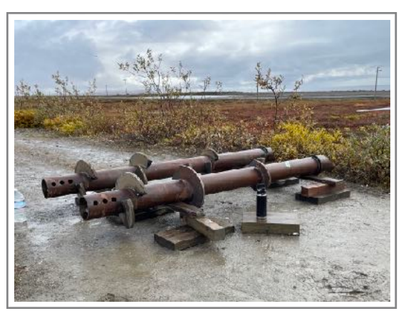
Helical screws for the new base

professional tower guys being available in September because