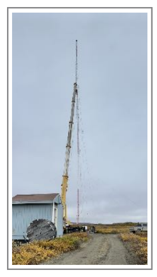
The tower is attached to a crane and the guy wires slacked.

In addition, the weather had to cooperate. I don't believe there were two consecutive days of no rain and minimal wind all summer, yet that's what we needed on the day the