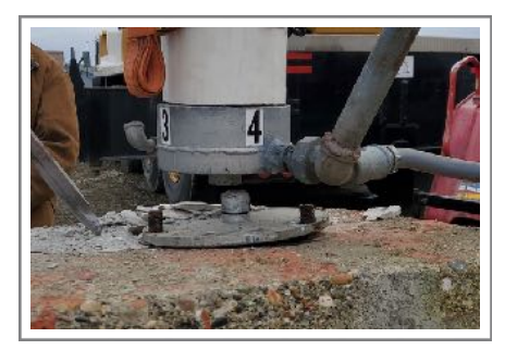
The tower is lifted off the pin it rests on. The old base is push/pulled out of the way and the I-Beam placed on the posts.

God knew we would need to do this now, not later, and took care of all of the details. We serve an amazing God!