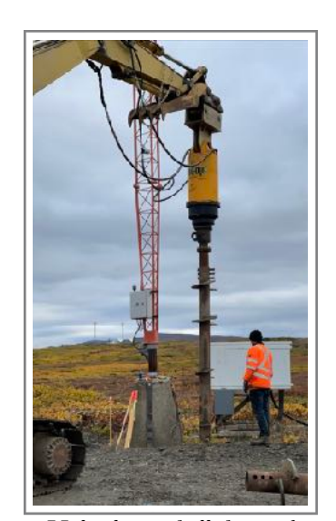
Helicals are drilled into the ground to a depth of 23'.

Once the team was in Nome, many other smaller things had to happen from getting additional local workers to making sure the correct parts and equipment were